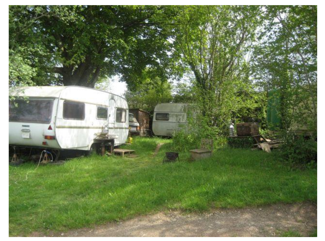
Tolerated unauthorised Traveller site in Devon

In addition, we want to work with all stakeholders, including public, private and voluntary/community sector organisations to meet the needs of Gypsies and Travellers and avoid unintended consequences of policy decisions that negatively impact on others. By detailing our policy and procedures within this Handbook, we hope to make our position clear so that we can align our approaches, and work together effectively and strategically.